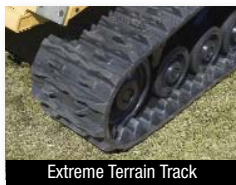
Extreme Terrain Track

treads for use in the widest range of ground conditions and applications. For applications where extremely wet, soft or slippery conditions are expected, the Extreme Terrain Tracks are a good option. These include deep tread lugs